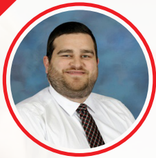
Miller Thompson Secondary Principal